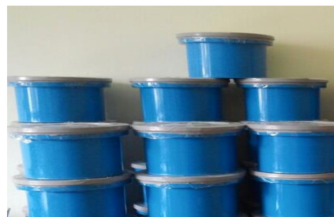
Figure 1. Concrete samples left for secular equilibrium

Sealed samples were left undisturbed for at least four weeks prior to being measured by the HPGe gamma spectrometer to establish a radioactive equilibrium in the ^{226}\text{Ra} decay chain segment member of uranium chain, ^{232}\text{Th} member of thorium chain and ^{40}\text{K} of the three naturally occurring potassium isotopes.